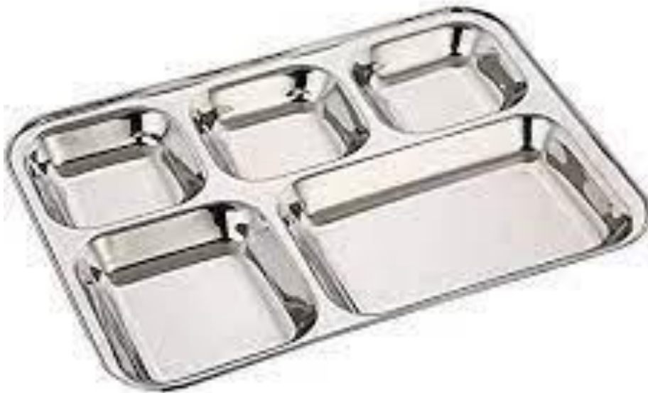
Diagram of Item No. 1 & Each container should be 1 inch deep (Dining Thatu)