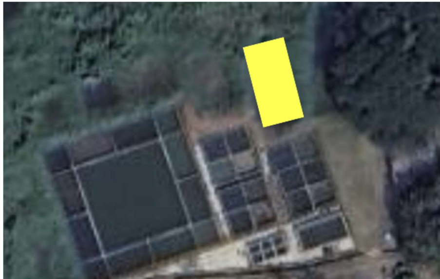
location: College of Fisheries, mangaluru

2 x USB 3.2 Gen 2, 2 x USB 2.0), Power Supply: 500W or higher. The location, depicted in the image below, measures 13ft X 48 ft and should include essential stone pitching and access for conducting experiments.