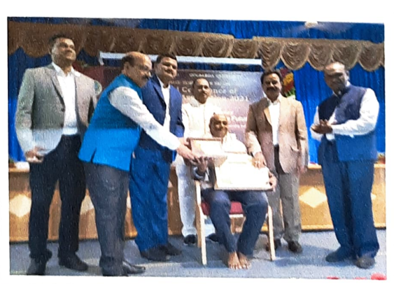
Librarian Receiving Award