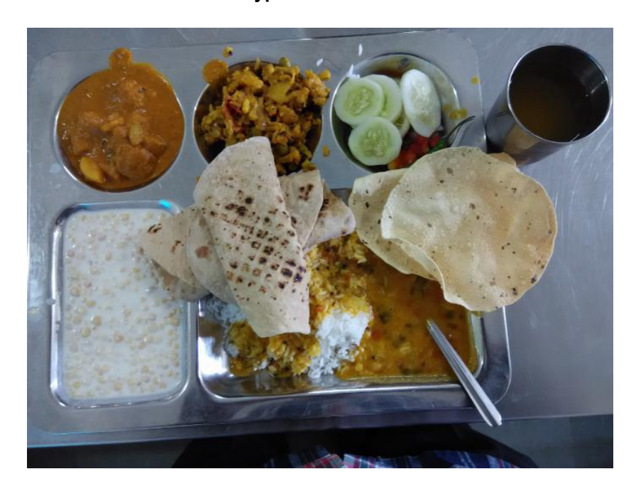
Typical Lunch plate