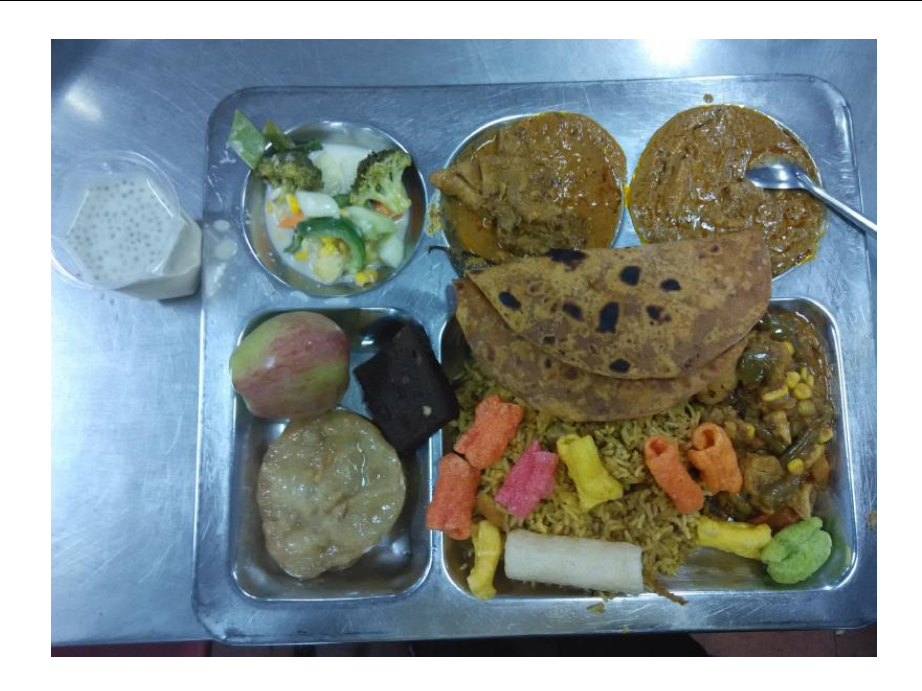
Typical Grand monthly Dinner Plate