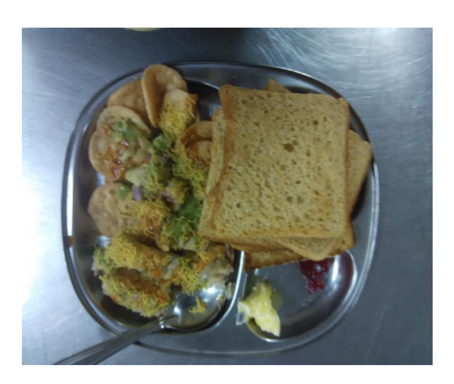
Typical Evening Snacks Plate